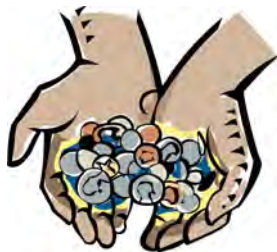
Tithes and offerings

This is just a small peek into what goes on in the office on a regular basis. Even though we are not holding in-person services right now due to COVID, the business of the church continues. The day care is up and operating each weekday and just like at your house, bills for the church still arrive almost every day. All the members of our congregation have been exceedingly faithful in keeping up with their tithes and offerings during these rocky COVID times. Thanks to all of you, when things start to open back up, we will be able to offer even more in the way of mission, education, and ministry to all of God's children here in the greater Mason area.